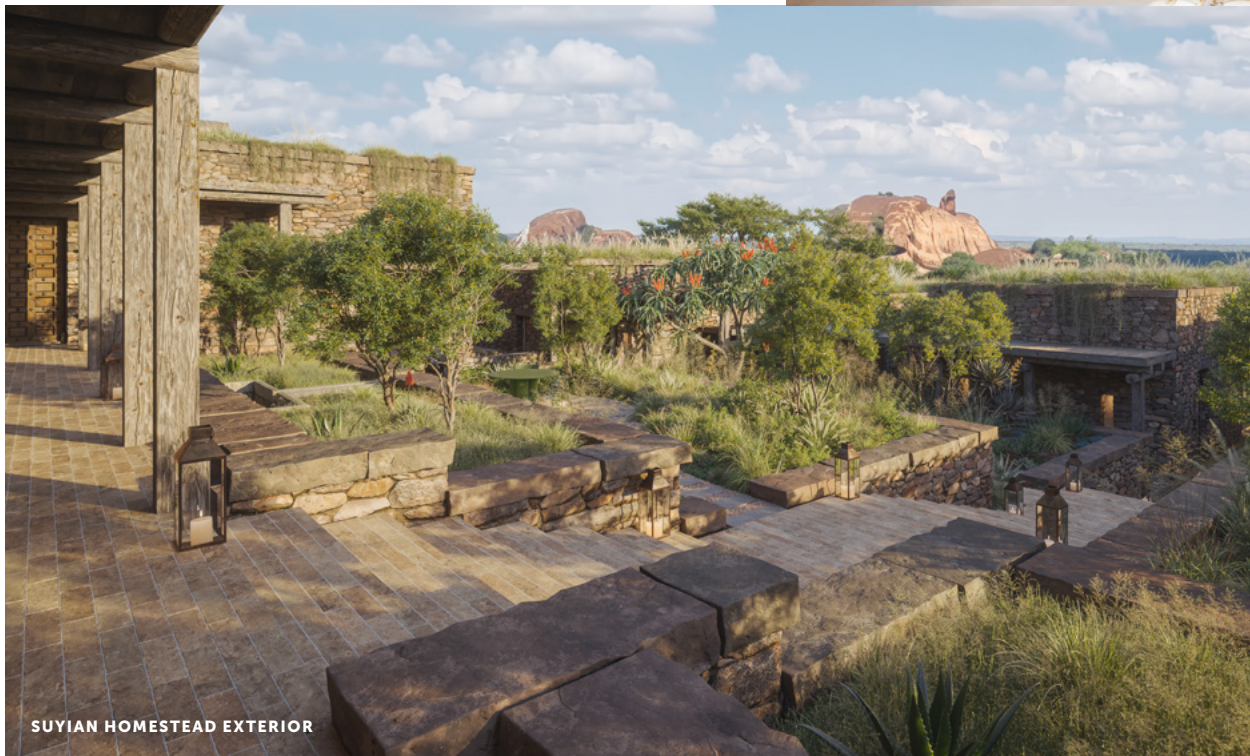
SUYIAN HOMESTEAD EXTERIOR