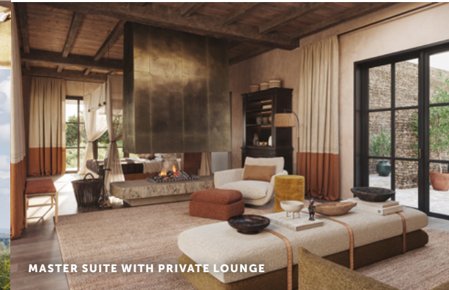
MASTER SUITE WITH PRIVATE LOUNGE