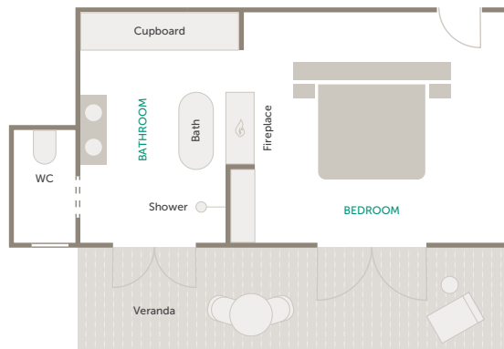
Typical Suite layout