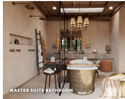
MASTER SUITE BATHROOM

Each space within Suyian Homestead is shaped by the land around it. Open, layered, and quietly comfortable, this private safari home invites you to settle in and stay awhile.