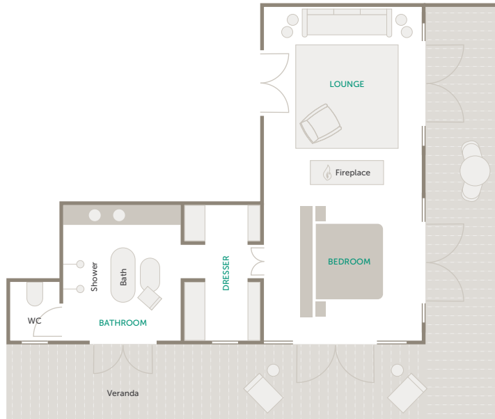
Master Suite layout